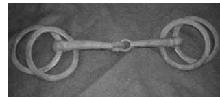
(Jointed Wilson Snaffle)

There was also a selection of horse bits which had to be identified. Some of them were quite tricky to name, but the most amazing thing about most of them was the sheer size of the older nickel bits.